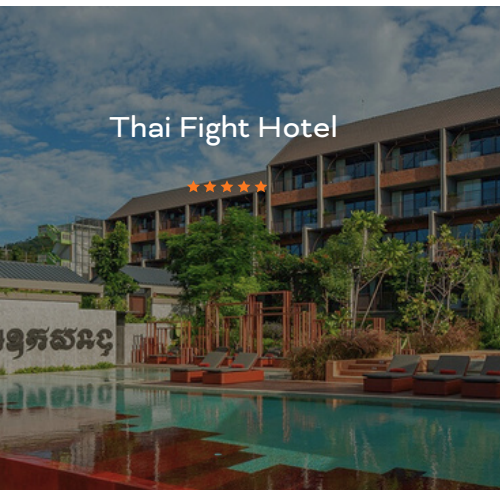
Thai Fight Hotel ★★★★★

Join us for an unforgettable first-ever teqball event on the beautiful tropical island of Koh Samui! We're excited to offer exclusive packages that include a 5-night stay at one of our partner hotels, daily breakfast, 5-day dinner at the hotel, and round-trip shuttle service from the hotel to the event venue.