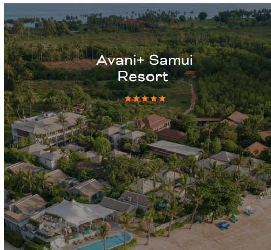
Avani+ Samui Resort ★★★★★