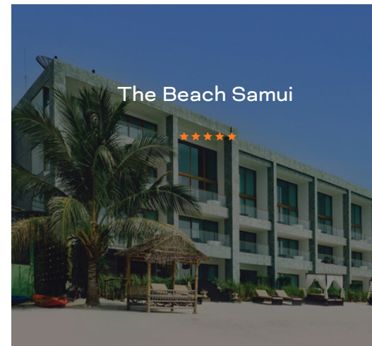
The Beach Samui ★★★★★